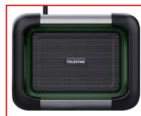
Robust protective grille protects the speakers