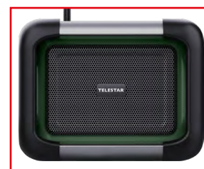
Robust protective grille protects the speakers