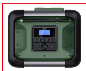
Clear control panel with LCD display and function keys