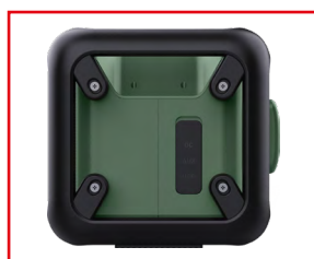
Side connections for AUX, USB and power supply