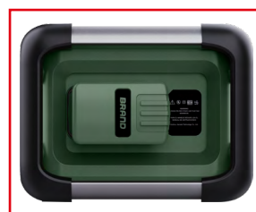
Battery slot with adapter for common manufacturer batteries